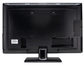
Back of TV